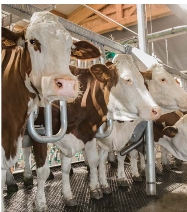
Gentle spring loaded sequence gates guide each cow from the wide entry area into its own comfortable milking stall.