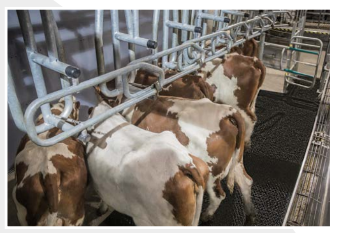
Unobstructed cow exit at the push of a button: The exit gate raises to a height of 1.6 meters, so even larger cows feel completely free to leave the milking parlor safely.